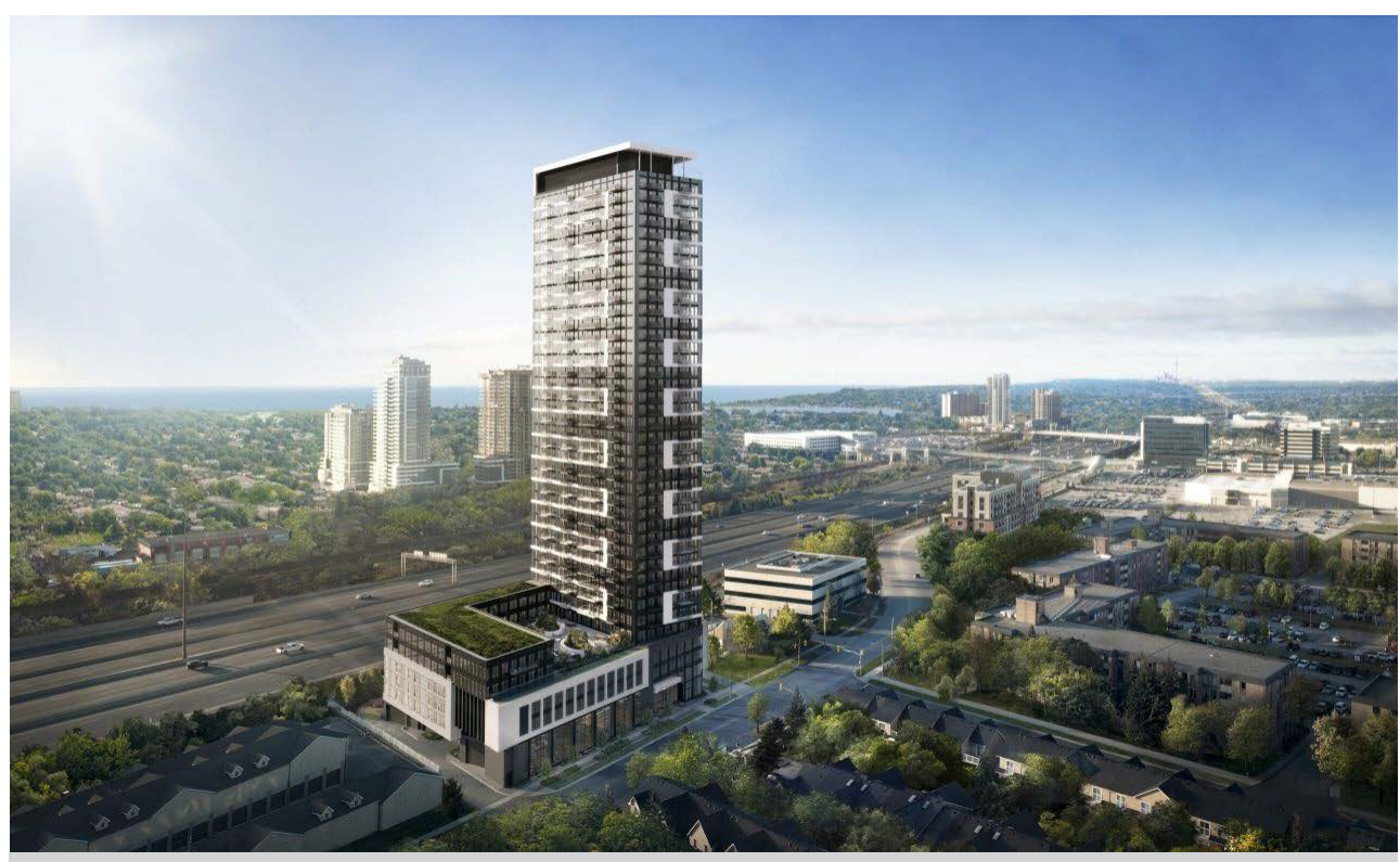
Looking southwest to 1515 Pickering Parkway, designed by Arcadis for Sevoy Developments

Its proximity to educational institutions further enhances its appeal. The University of Toronto Scarborough is just an 11-minute drive away, making it an ideal off-campus housing option for students and faculty. Additionally, the Oxford College of Arts, Business, and Technology's Scarborough Campus is a 14-minute drive.